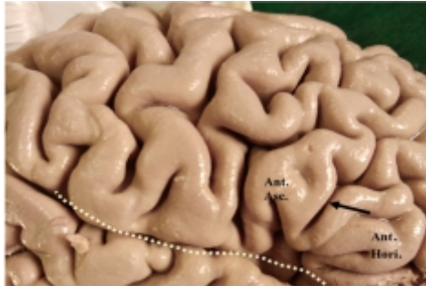
Figure 3: Triangularis sulcus (black arrow) in right Cerebral hemisphere in pars triangularis between Anterior horizontal (Ant. Hori.) and Anterior ascending ramus (Ant. Asc.). Dotted line indicates Lateral sulcus

The diagonal sulcus (Figure 2) was noted in 32 (59.25%) hemispheres, while the triangularis sulcus was identified in 45 (83.33%) hemispheres (Figure 3). However, the presence of the triangularis sulcus was not dependent on the side ( p > 0.05 ). On the contrary, the diagonal sulcus was frequently present on the left side ( p < 0.05 ).