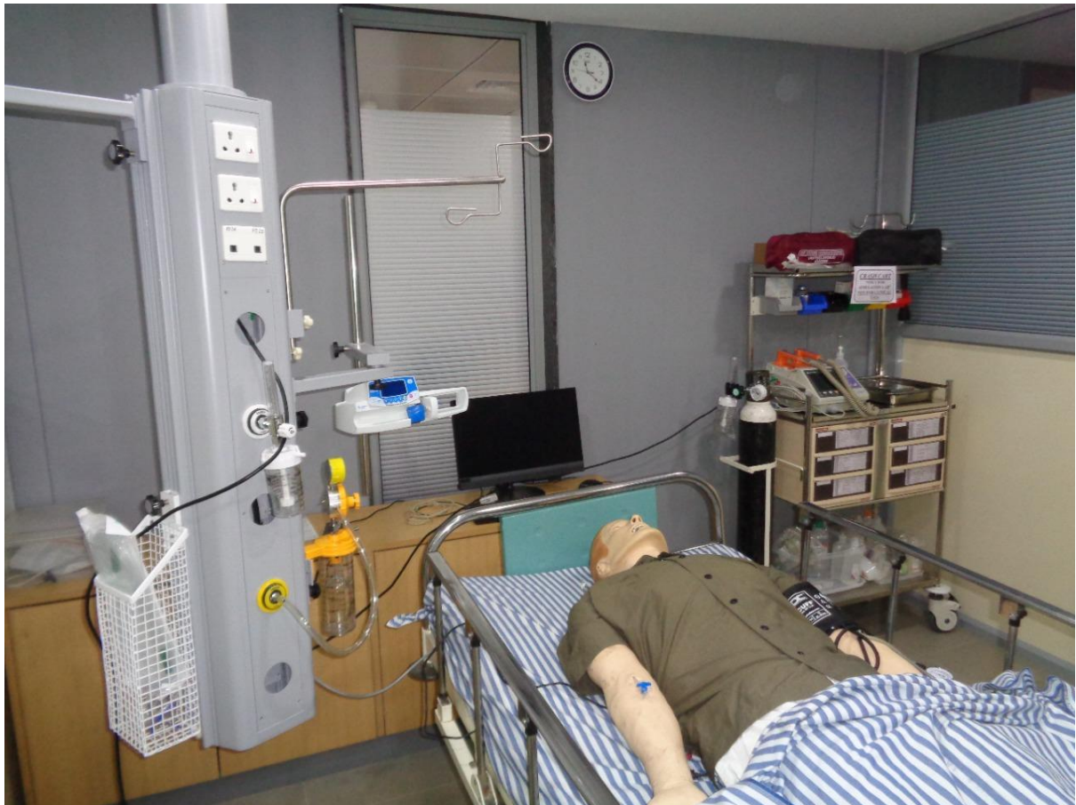
Sim Man 3G