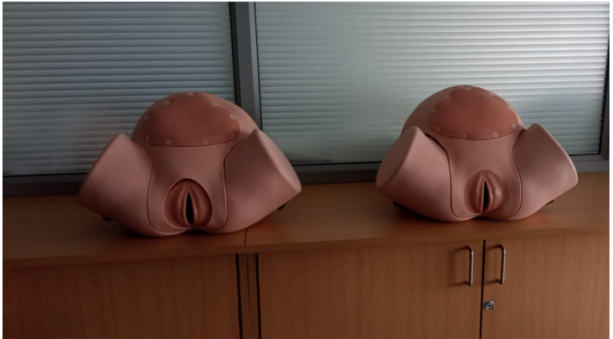
Birthing Simulator mannequin