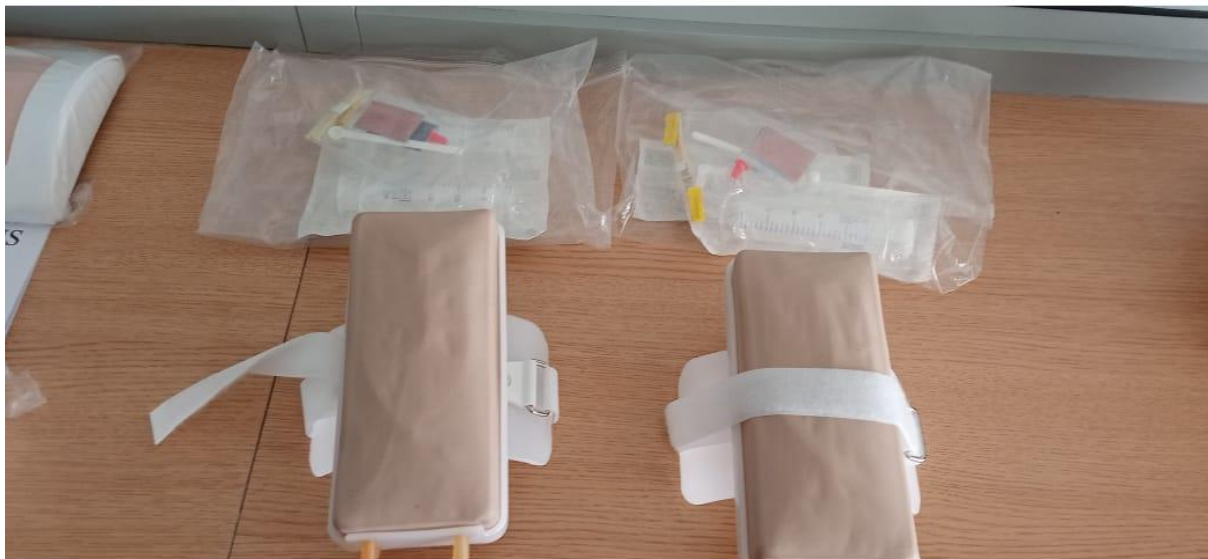
Venatech IV Trainer