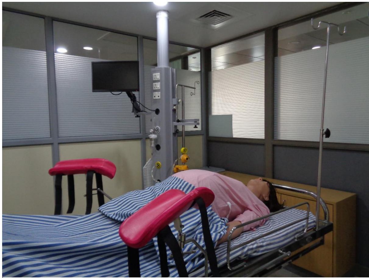
Lucina-matrenal foetal simulator