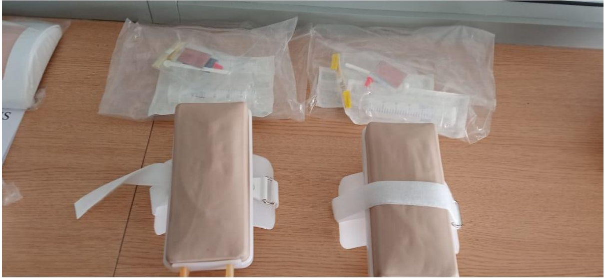
Venatech IV Trainer