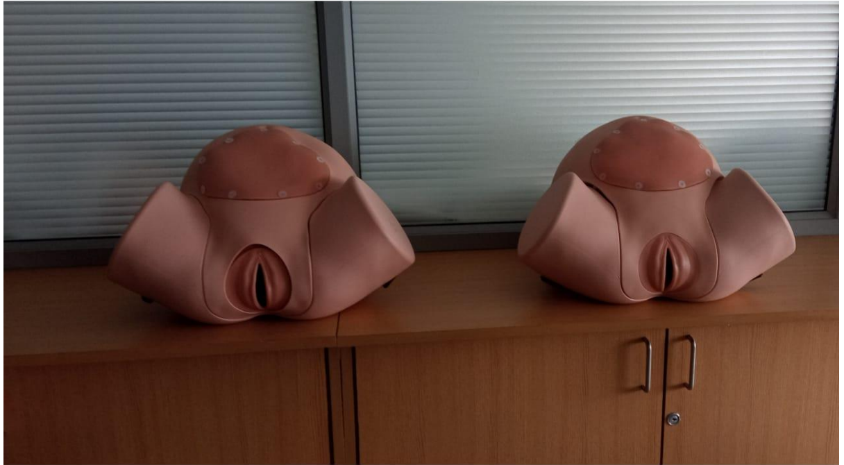
Birthing Simulator mannequin