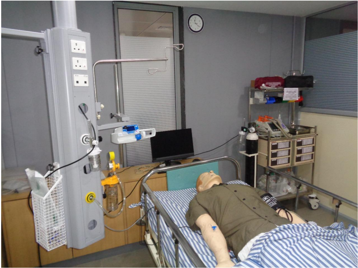
Sim Man 3G