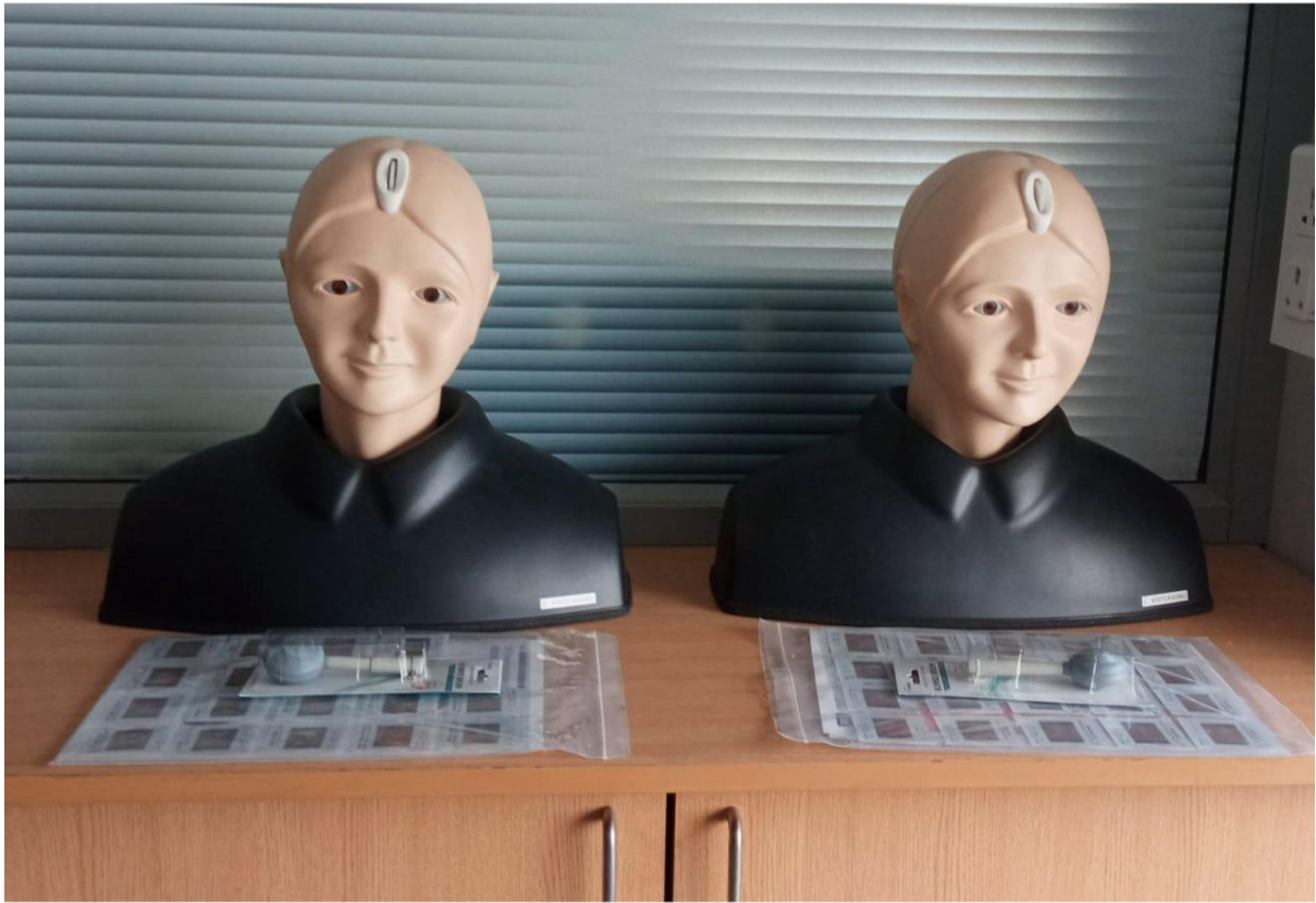
Eye Examination Simulator