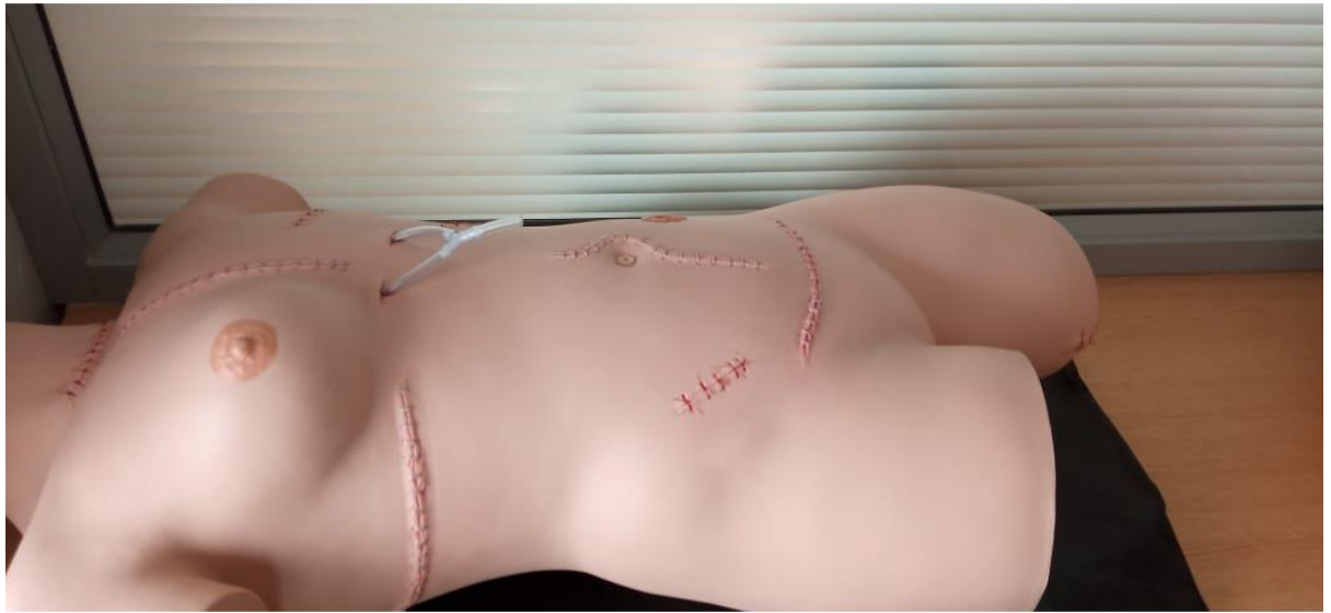
wound care bandaging skill trainer