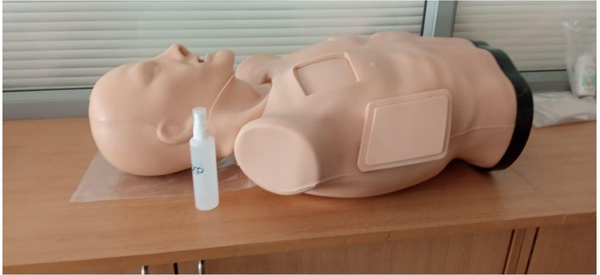
Chest drain simulator