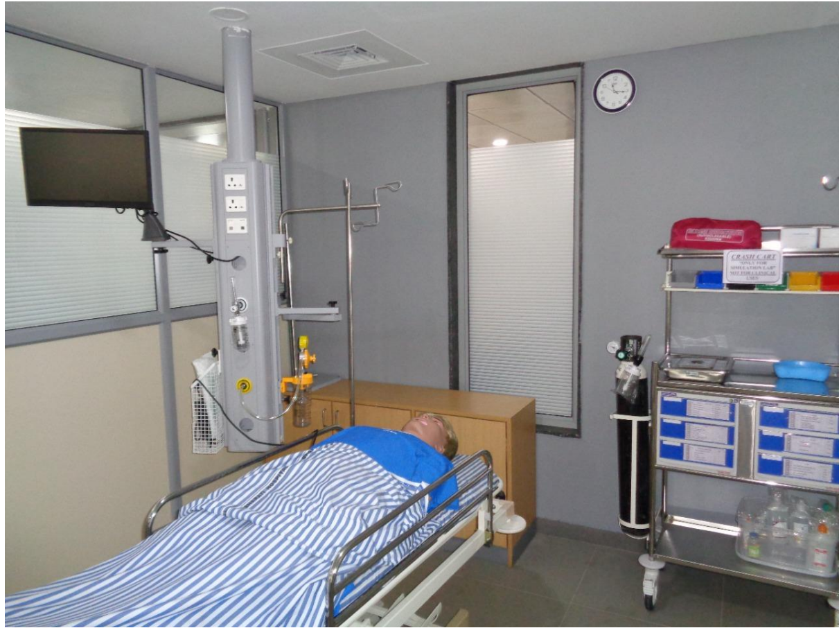
Ares ACLS mannequin