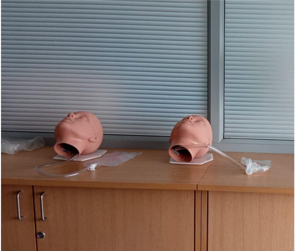
Ng tube trainer