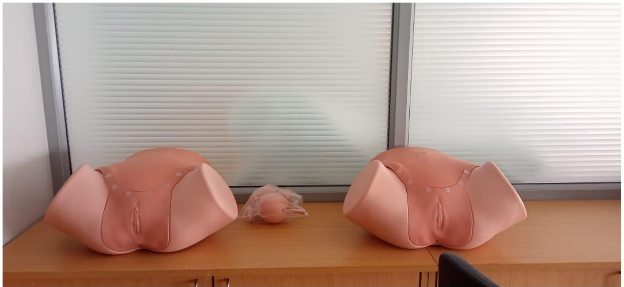
Female pelvic examination