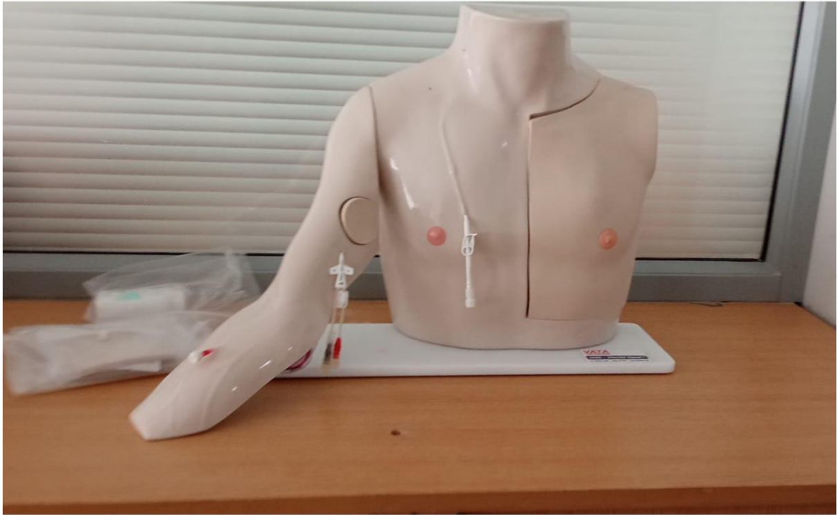
Chester Chest with advanced right arm