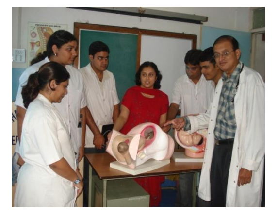
Hands On Training for students- using models

There is adequate qualified teaching as well as nonteaching staff as per MCI rules. All the teaching –learning technologies are made use of, including the power point presentations, seminars, integrated teaching for UGs & PGs and group discussions with the use of teaching models.