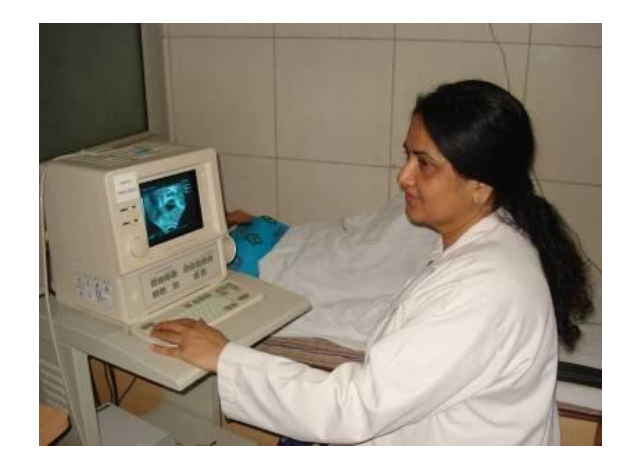
Infertility clinic - follicular monitoring

All the modern facilities required for managing these patients, include endoscopes (diagnostic as well as operative laparoscope & hysteroscope), USG machine for ovulation monitoring, equipment for semen wash & IUI, digital colposcope and equipment for HDU are available with best laboratory (including endocrinology) and radiology back up.