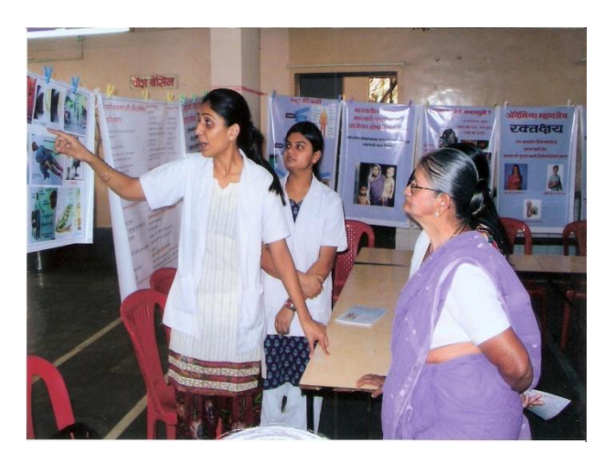
Health exhibition organized on occasion of World Women's Day- 2008