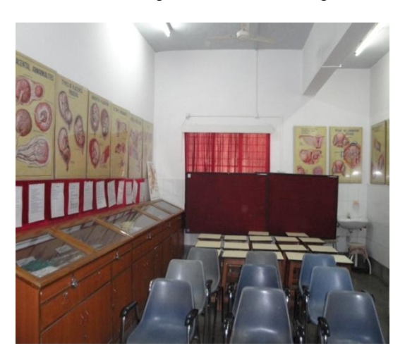
Museum & Seminar Room

Regular formative and summative evaluation for the students is done, with student feedback.