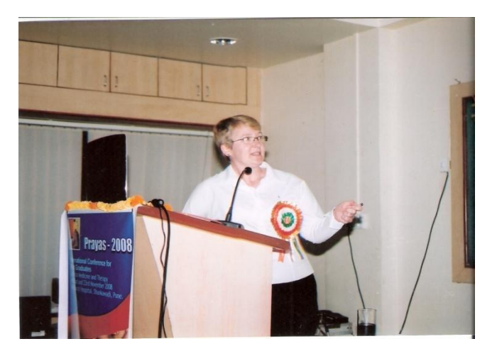
Guest Lecture - "PRAYAS"

• A unique activity, a conference for postgraduate students is organized every 2yrs "PRAYAS" since year 2004, which is well appreciated at all levels.