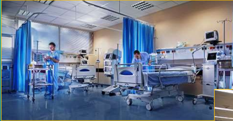
State of art ICU, HDU