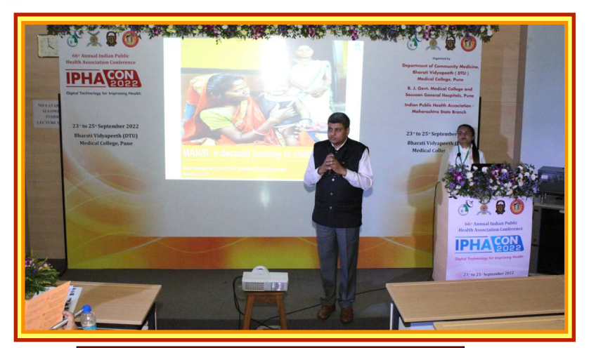
Alternate dimensions in public health

The preliminary round of PG quiz was conducted by 'the national IPHA PG quiz group'. in which 36 teams participated and 10 teams were selected for the final round that was conducted on day two of the conference.