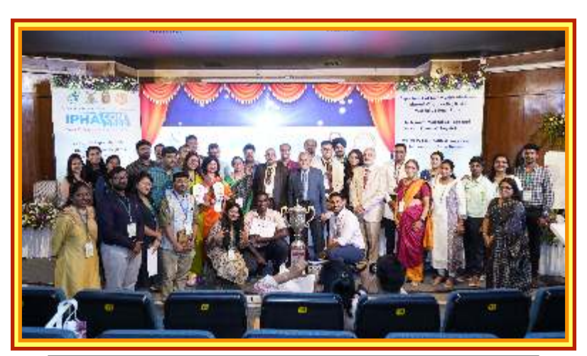
National IPHA PG Quiz winner with the trophy

Final round of National IPHA PG Quiz was conducted as the last session of day two of the conference. First as well as second position was won by AFMC, Pune.