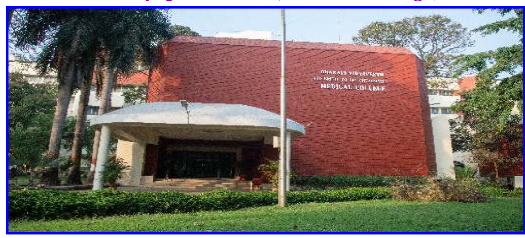
Bharati Vidyapeeth (DTU), Medical College, Pune