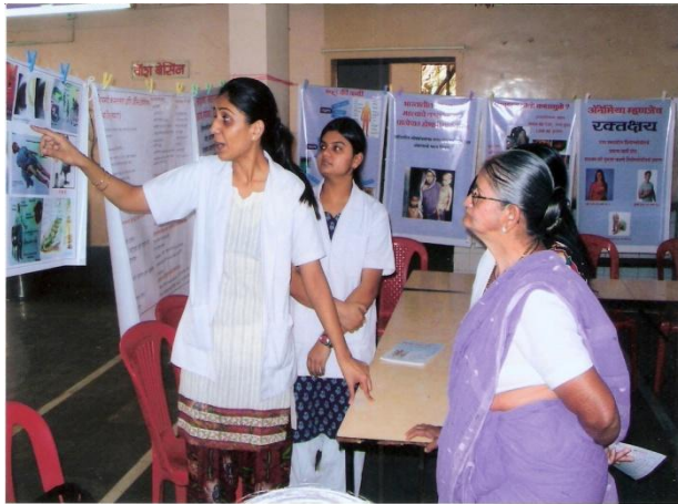
Health exhibition organized on occasion of World Women's Day- 2008