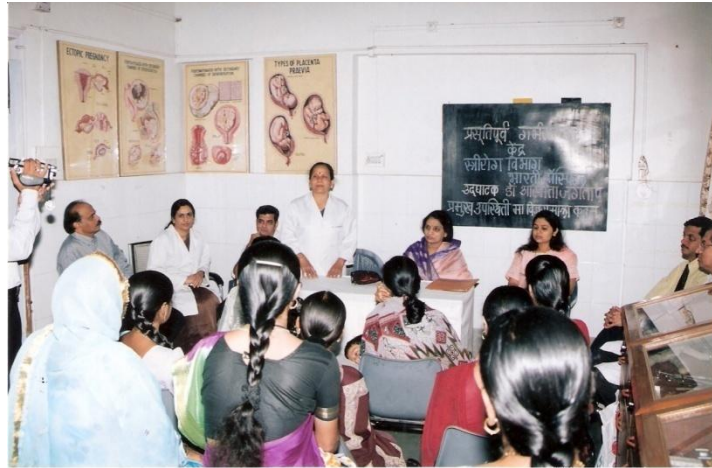
Inaugration ANC Class

Outpatient department caters to approx. 150 patients per day. In addition to routine ANC, PNC clinics, specialty clinics ie: Infertility, Cancer detection, ICTC, High risk pregnancy unit, Well woman clinic, Prasutipurva garbhasanskar are conducted.