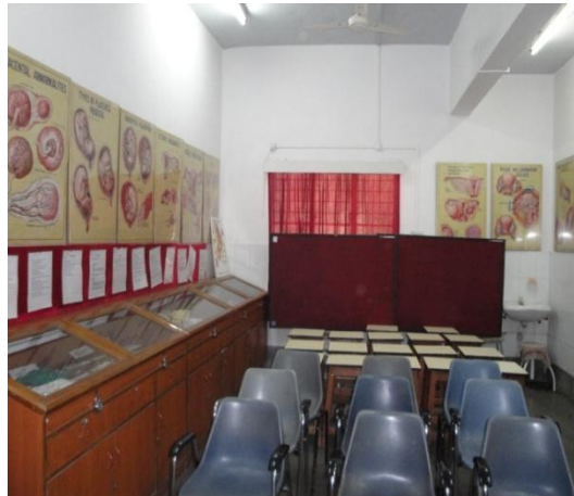
Museum & Seminar Room

Regular formative and summative evaluation for the students is done, with student feedback.