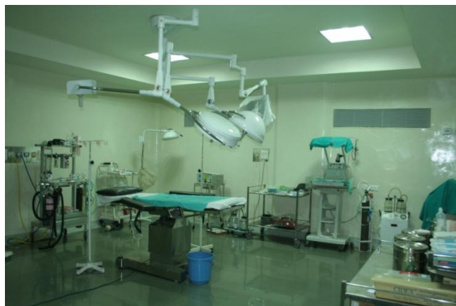
Gynecology operation theatre

Both undergraduate and postgraduate (MCI recognized Diploma & Degree) courses are conducted.