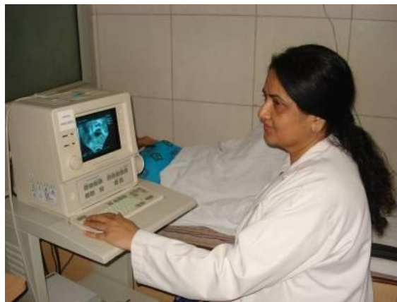
Infertility clinic – follicular monitoring

All the modern facilities required for managing these patients, include endoscopes ( diagnostic as well as operative laparoscope & hysteroscope ) , USG machine for ovulation monitoring, equipment for semen wash & IUI, digital colposcope and equipment for HDU are available with best laboratory ( including endocrinology) and radiology back up.