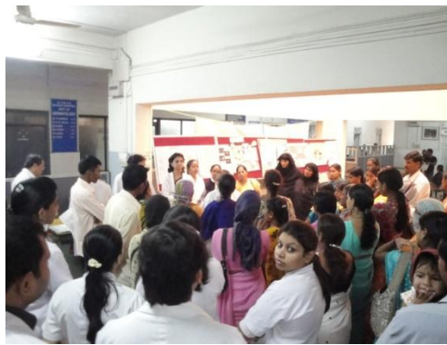
Health Exhibition – Cancer Day 4 Feb 2010