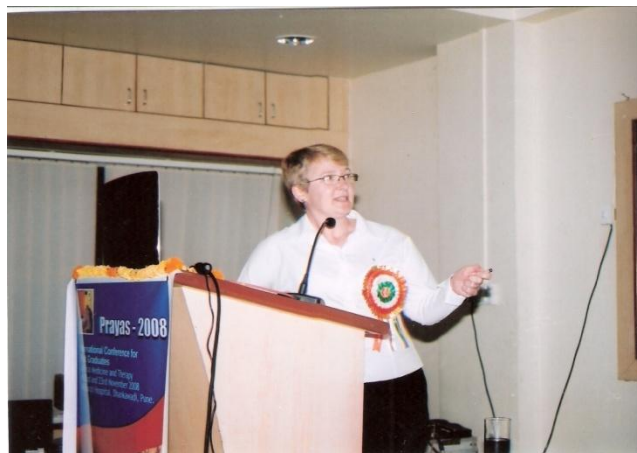
Guest Lecture – "PRAYAS"