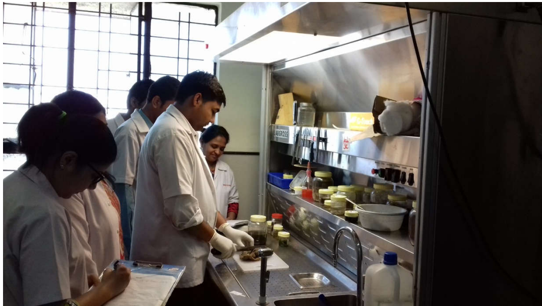
HISTOPATHOLOGY GROSSING STATION