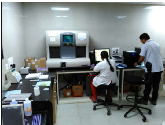
AUTOMATION IN HAEMATOLOGY LAB